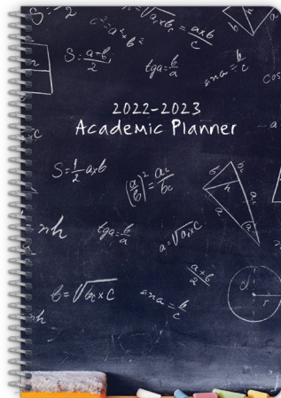
STANDARD CARDSTOCK COVER

UPGRADE YOUR COVER! View all your cover options at SchoolDatebooks.com !